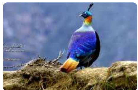
LOPHOPHORUS (DANFE), NATIONAL BIRD OF NEPAL