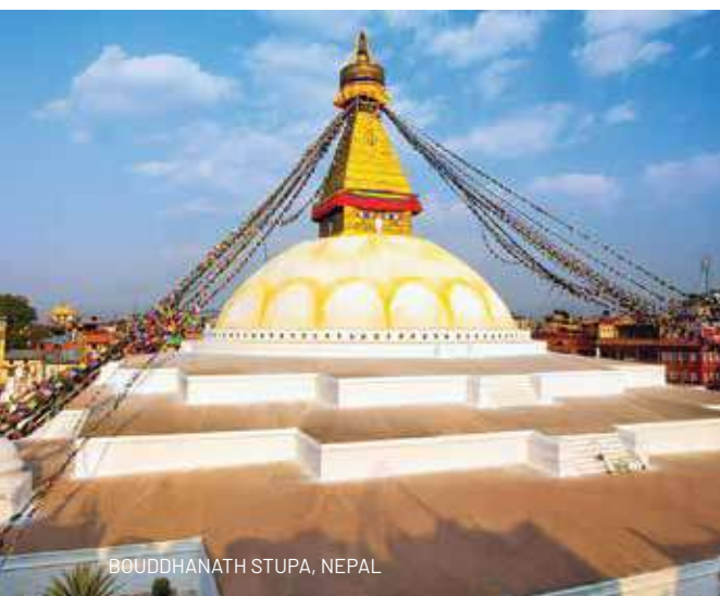
BOUDDHANATH STUPA, NEPAL

Truth, no less colorful than fiction, has made NEPAL one of the world's most incredible countries, a geographical wonder, and an ethnological conundrum. NEPAL is a mosaic of corners, each waiting to give you an unexpected thrill. NEPAL is a handful of secrets, with the palm held open. The wild rivers are waiting to be run, birds and wildlife to be discovered, and mountains to be climbed. There are foods, smells, and sights that are beyond your imagination. Yet, it is a treasure box waiting to be opened by the travelers in leisure.