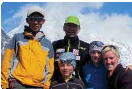
FAMILY TOUR IN NEPAL