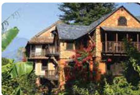
VILLAGE HOMES, NEPAL