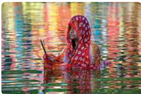
CHHATH FESTIVAL, NEPAL

The Himalayan Regions of Nepal, India, Tibet and Bhutan are considered as a trekking paradise of the world. Everest and Annapurna Trekking Regions of Nepal are ranked among 10 best selected trekking destinations of the world. Newly Developed Great Himalayan Trails of Nepal is one of the longest and scenic trekking routes. Similarly, Langtang Valley Trek, Kanchanjanga Trek and Dhaulagiri Treks are other notable trekking routes in Nepal. Leh Ladhak with Kashmir Trek, Manali Height Treks, Sikkim Valley Treks are the most fascinating trekking routes of India. There are scenic trekking routes in Bhutan and Tibet, China as well. Fishtail Group has been organizing many uphill trekking package programs as Tea House Treks or Guest House Treks and full Camping Treks.