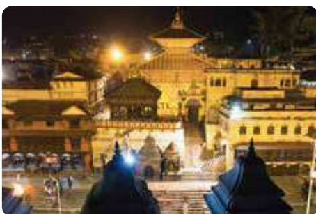
PASHUPATINATH TEMPLE, NEPAL

This is a unique program introduced by Fishtail Group. Most of the Scenic traditional villages and famous trekking routes are accessible by rough and uneven motorable road where only 4WD vehicle can be driven. To enjoy the local culture, history and scenic beauty of the mountain, Fishtail Group has brought 4WD tour program with tented camp and tea house accommodation with services of qualified Nepali Sherpa team. Fishtail Group request all the nature, culture and adventure lover to join on this unique 4WD tour program.