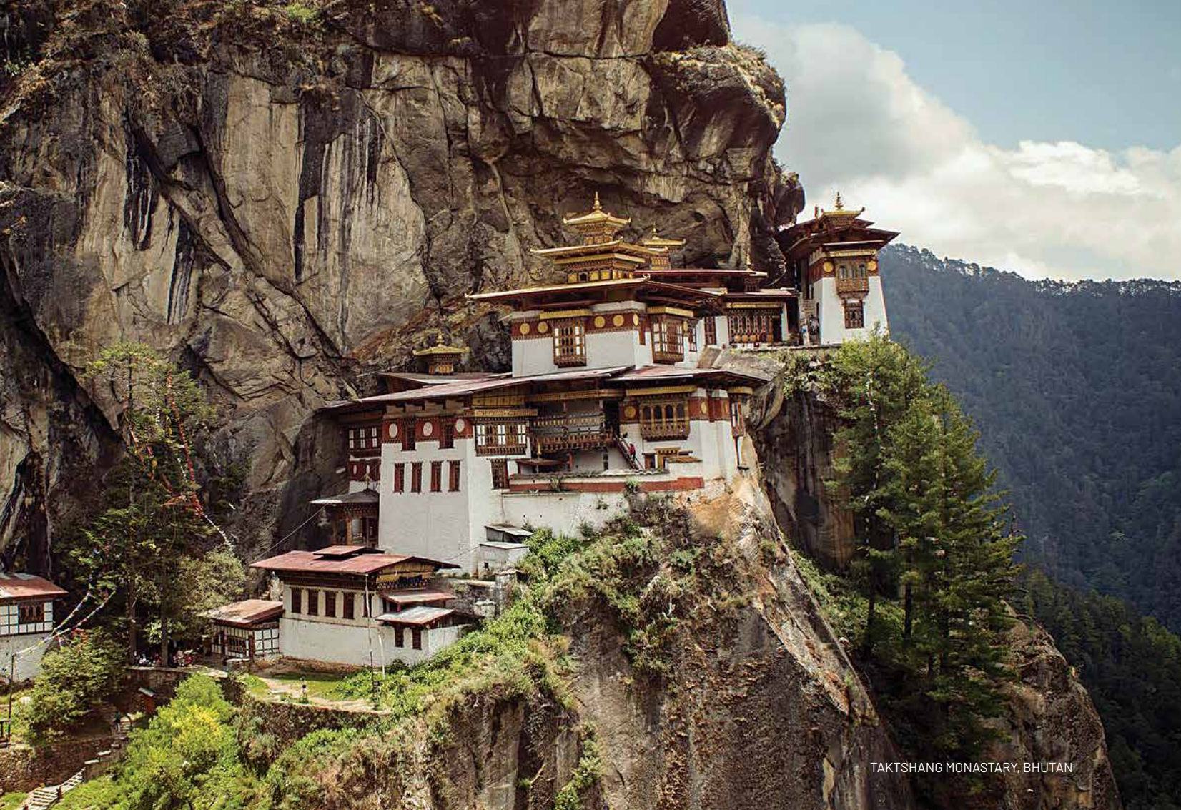
TAKTSHANG MONASTARY, BHUTAN