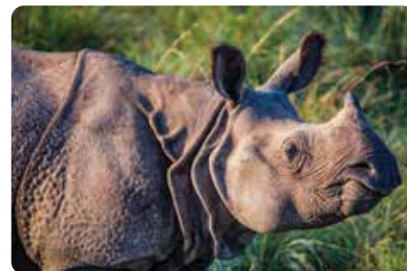
ENCOUNTERING WITH RHINO IN JUNGLE SAFARI